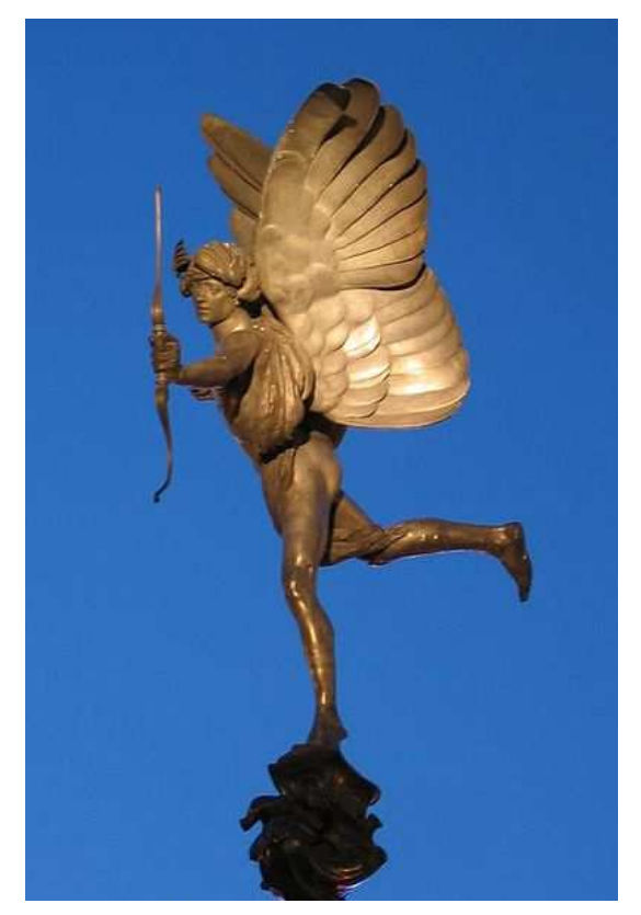
Anteros by <u>Alfred Gilbert</u>, 1893; from the Shaftesbury Memorial in Piccadilly Circus

Piccadilly Circus is a road junction and public space of London's West End in the City of Westminster, built in 1819 to connect Regent Street with the major shopping street of Piccadilly. In this context, a circus, from the Latin word meaning "circle", is a round open space at a street junction.